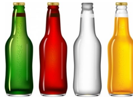
* 2017 Wisconsin Youth Risk Behavioral survey